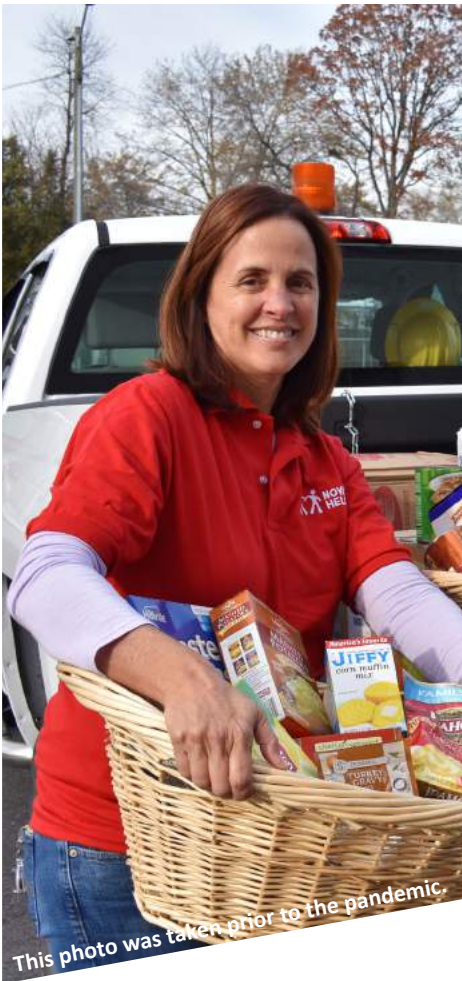
This photo was taken prior to the pandemic.